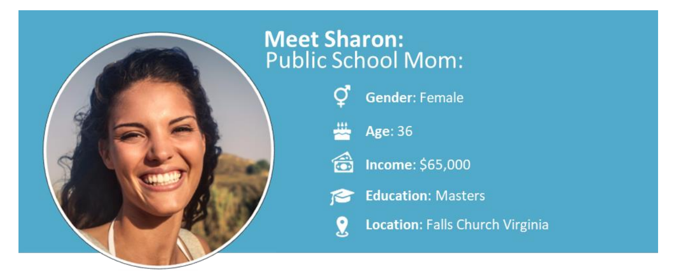
Don't just talk about what you want to talk about, talk about what your ideal parents want to know about!

This should be a broad topic that will be comprised of many sub-topics. Everything should relate to something that your school offers or is known for, and that you would want to be found for by a parent or student searching on Google for a school like yours.